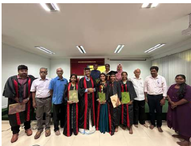
First Batch M. Sc. Mathematics students