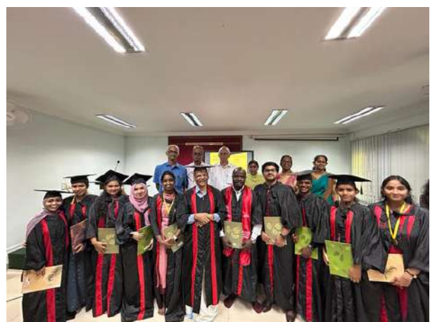
First Batch M. Sc. Statistics students